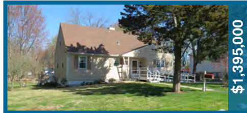
20 Hunt Place / Rye 10580 4BR/2.0B / 2052 sqft / FEATURED LISTING

Unique opportunity to build your dream home on 1.92 acres on private road. Walk to Rye Golf, elementary school and train.