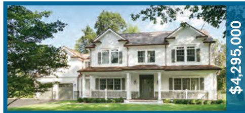
67 Halsted Place / Rye 10580 5BR/4.2B / 6172 sqft / FEATURED LISTING

Renovated classic tutor in wonderful neighborhood in walking distance to beach, parks, schools and more.