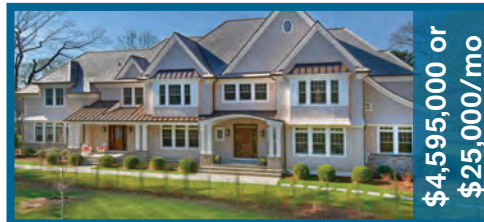
265 Milton Road / Rye 10580 6BR/6.2B / 8026 sqft / FEATURED LISTING: SALE / RENT

Colonial with exquisite craftsmanship on cul-de-sac in Purchase Estates. Overlooks golf course.