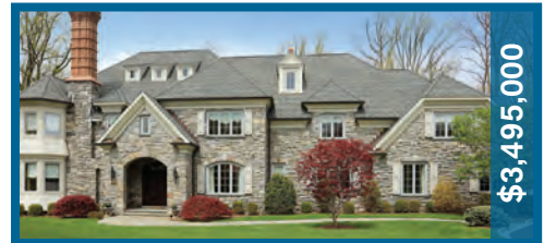
6 Fairway Drive / Purchase 10577 6BR/6.1B / 10,335 sqft / FEATURED LISTING

By Susie Cappelli (SAC Development) & Tom Demasi (Alpine Construction); exquisite craftsmanship, luxurious amenities.