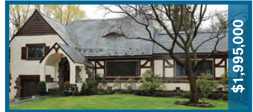
53 Lynden Street / Rye 10580 5BR/3.0B / 3663 sqft / FEATURED LISTING

Unique opportunity to build your dream home on 1.92 acres on private road. Walk to Rye Golf, elementary school and train.