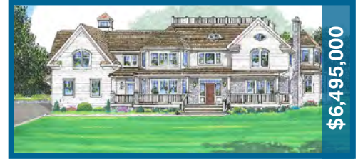
1 Pine Island Road / Rye 10580 8BR/8.2B / 7985sqft / PRE-CONSTRUCTION