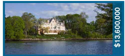
131 Kirby Lane / Rye 10580 6BR/7.3B / 11,531sqft / JUST LISTED