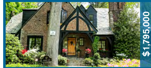
17 Overdale Road / Rye 10580 4BR/3.1B / 3170sqft / JUST LISTED