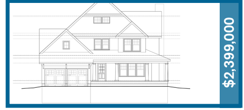
34 Helen Avenue / Rye 10580 5BR/4.1B / 3400sqft / NEW CONSTRUCTION

As of 7/23/13. Note: All prices indicated are LIST PRICES.