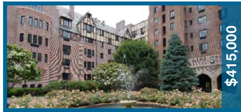
66 Milton Road # E51 / Rye 10580 2BR/1.0B / 998sqft / COOP/NEW PRICE

Thankfully, the market forecast is clear as the clouds of the last five years continue to lift. Pricing properties with a clear business-minded process will enable Sellers to achieve success. ■