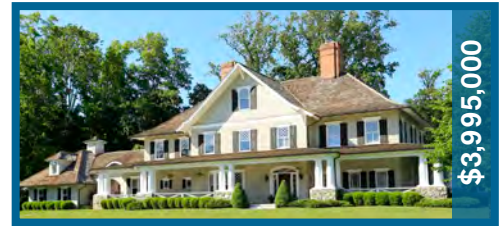
4 Fairway Drive / Purchase 10577 8BR/7.4B / 8647sqft / JUST LISTED