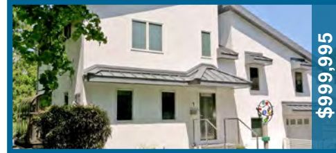
1 Dale Street / Rye 10580 4BR/3.0B / 2277sqft / JUST LISTED