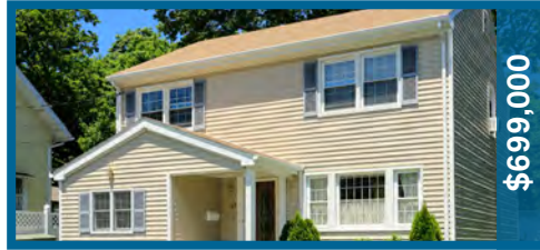
37 Sanford Street / Rye 10580 3BR/1.1B / 1742sqft / NEW PRICE