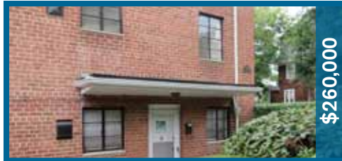
181 Purchase Street #2 / Rye 10580 1BR/1B 650sq ft / JUST LISTED