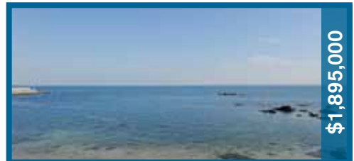
167 Kensington Oval / New Rochelle 10805 4BR/3.1 4000sq ft / CURRENT LISTING