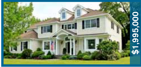
24 Johnson Place / Rye 10580 5BR/4.1B 5000sq ft / JUST LISTED