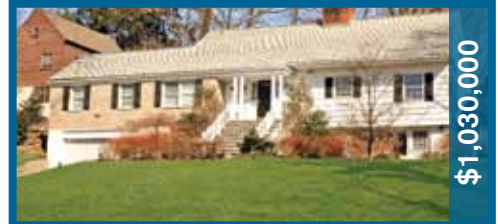
127 Sunny Ridge Road / Harrison 10528 4BR/4B 3720sq ft / CURRENT LISTING