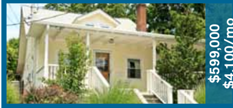
10 Bulkeley Manor / Rye 10580 3BR/1B 1100sq ft / JUST LISTED