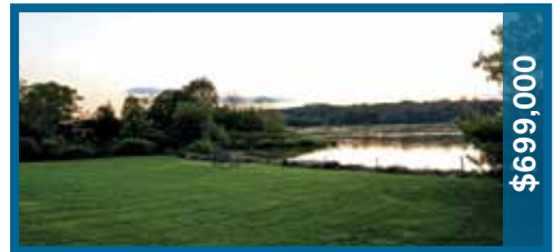
720 Milton Rd # S4D / Rye 10580 3BR/2.1B 2100sq ft / COOP