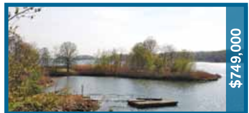
720 Milton Rd # E4 / Rye 10580 2BR/3B 2250sq ft / COOP