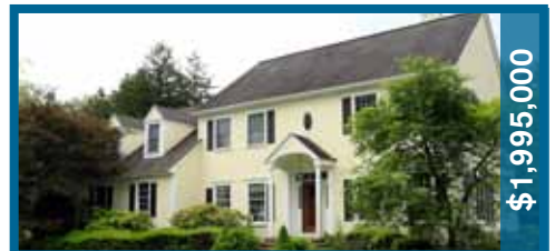
1 Billington Court / Rye 10580 5BR/4.2B 3700sq ft / CURRENT LISTING

As of 7/7/12. Note: All prices indicated are LIST PRICES.