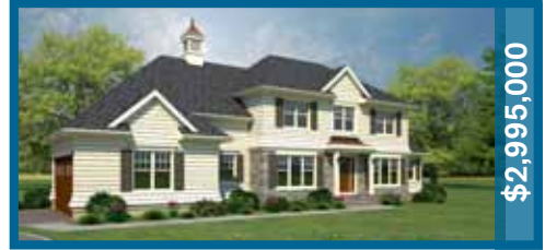
5 Fieldstone Road / Rye 10580 5BR/4.1B 4291sq ft / NEW CONSTRUCTION